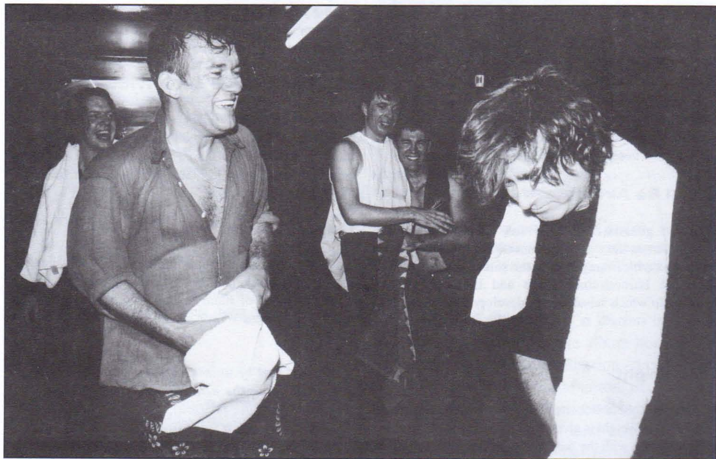
"I like bands which work hard - I train up before going out on tour, but that falls by once we're on the road"