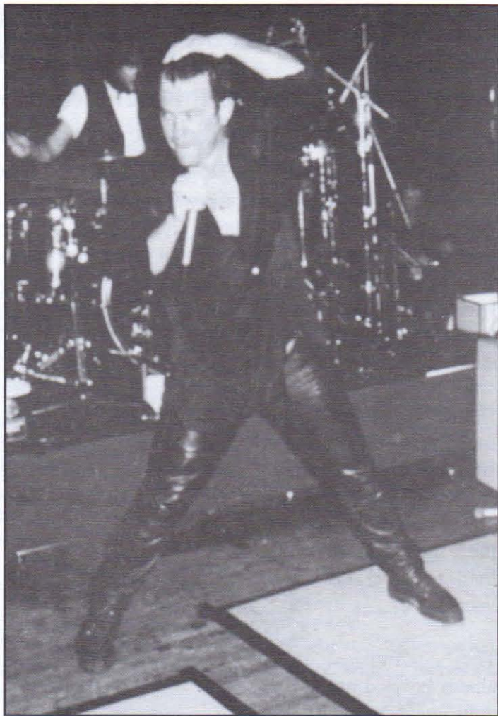
"Studio is hard work, but live you get instant gratification if you play good shows"