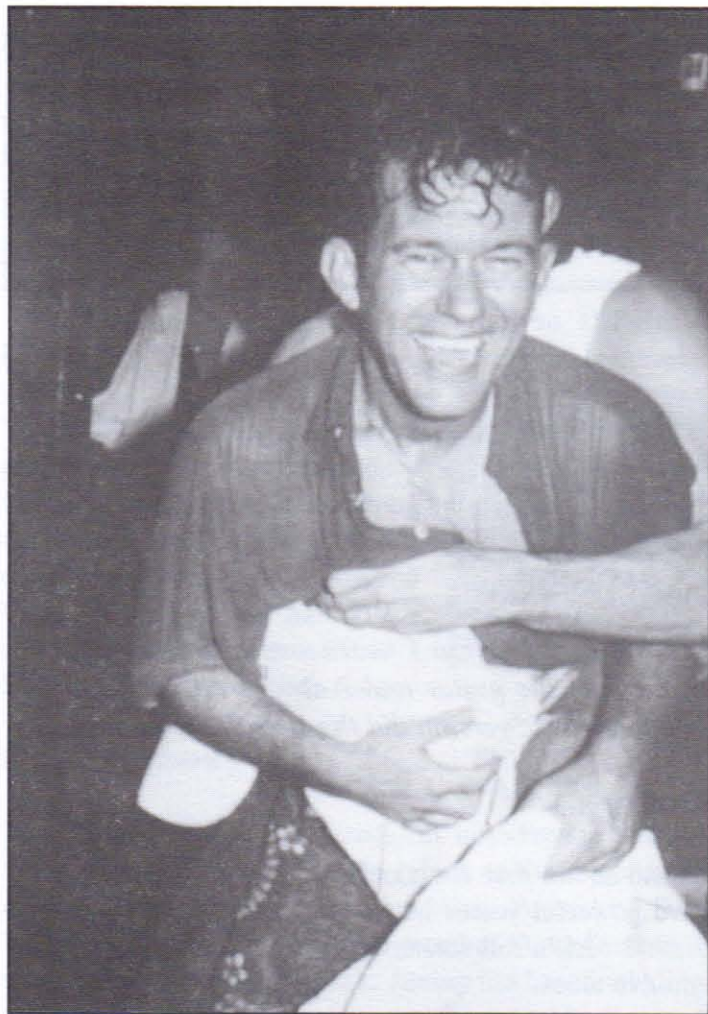
"I love music and I love touring - I can't give it up"